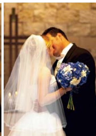
Above: Before and after wedding photos with a Veil-and-Textures veil added over the bride's actual veil. Left: Screen capture of the Veil-and-Textures interface showing the different veils available.

In the current economy, where the professional portrait and wedding photographer's main competition is not other photographers but rather all of the necessities and luxuries of life, competing for sales can be very difficult. Being able to offer unique looks in your work is often the key to profits, and Veil and Textures software may be the answer for you.