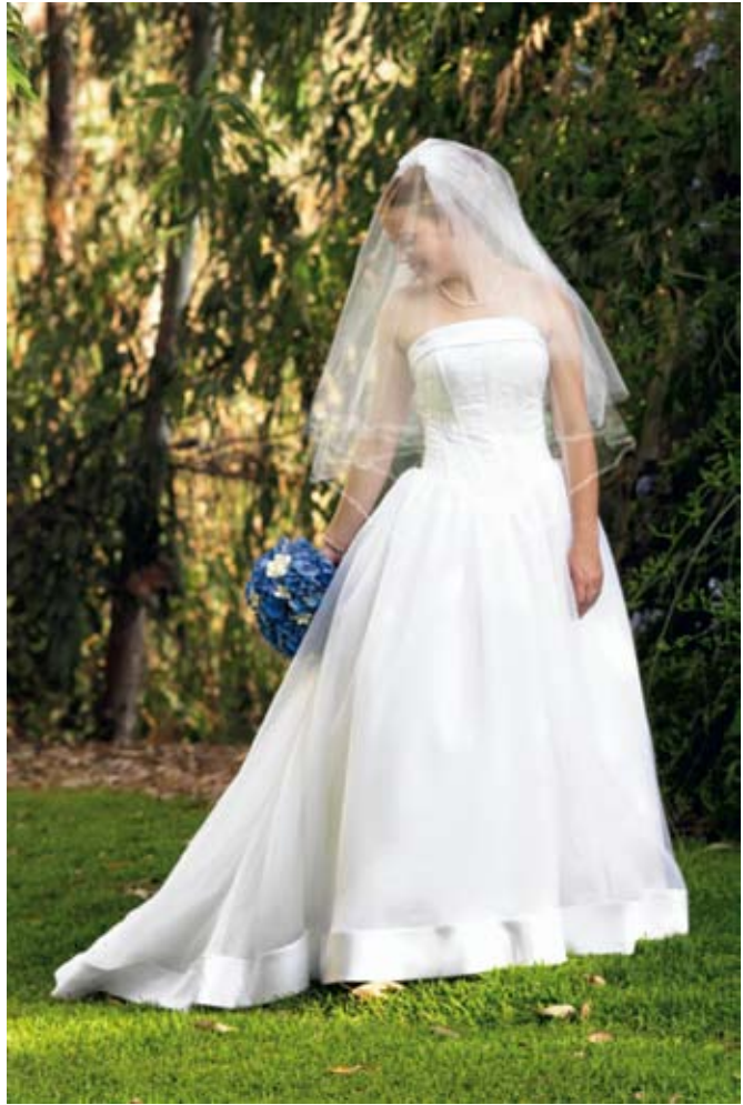
Before and after wedding photos with a Veil-and-Textures veil added over the bride's actual veil.

document window so there is a little space around the image.